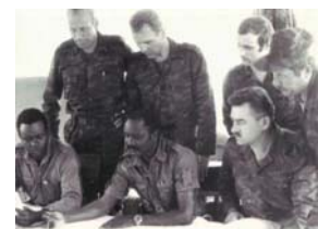
A group of Russian advisers assisting with planning of a FAPLA operation