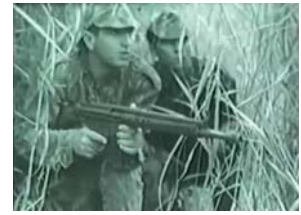
Portuguese soldiers with G3 rifles during the Portuguese Colonial War, 1961-1974

For more detailed information on the G3, see Wikipedia: http://en.wikipedia.org/wiki/Heckler_%26_Koch_G3