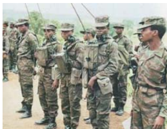
Angolan FAPLA soldiers on parade for inspection