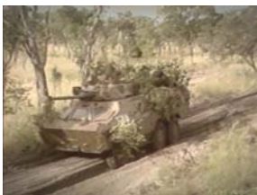
Ratel-90 following in the tracks of the preceding vehicles. Notice how exact the wheels fit in the tracks