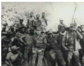
Russian advisors with the staff of the Fapla brigade they were allocated to