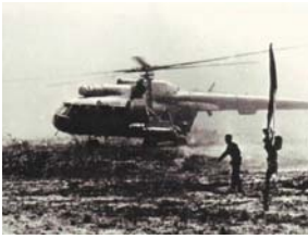
Mi-8 Hip helicopter landing somewhere in Angola