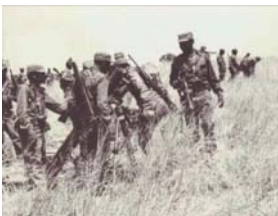
Fapla mortars being deployed for action

hear, quite clearly and precisely, South Africans discussing among themselves. Thank God that I still remember a little English.