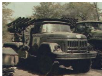
Soviet-supplied BM-14 and BM-21 Multiple Rocket Launchers