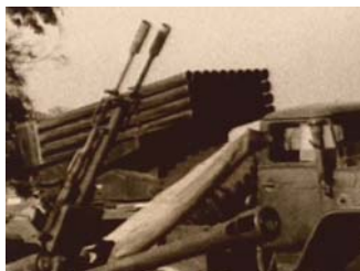
23mm AA gun in front of a BM-21 Multiple Rocket Launcher