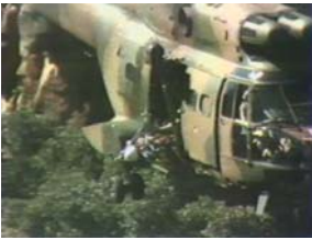
South African Puma helicopter with a CASEVAC (Casualty Evacuation)