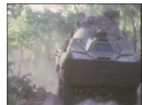
Business side of a South African Ratel-20

http://www.warinangola.com/Default.aspx?tabid=574