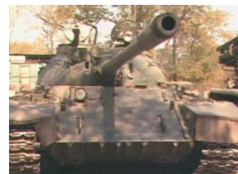
A T-55 tank, with the business end of its 100mm gun

Images from "Grensoorlog" series, by Linda de Jager, reproduced with kind permission by MNET