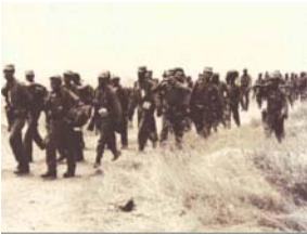
FAPLA soldiers of the MPLA on the move

Link to this story: http://www.warinangola.com/Default.aspx?tabid=1049