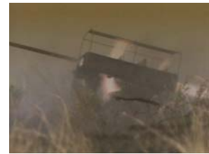
South African Valkyri 127mm Multiple Rocket Launcher firing a rocket