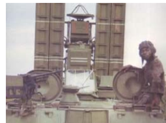
Soviet-supplied SA-9 AA missile system of the Angolan forces