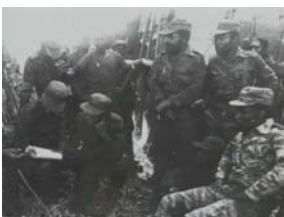
FAPLA officers in conference

Link to this story: http://www.warinangola.com/Default.aspx?tabid=1081