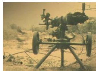
B-10 82mm anti-tank gun used by the Angolan forces