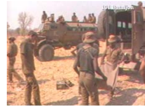
101 Battalion Casspirs and crews getting ready to move out