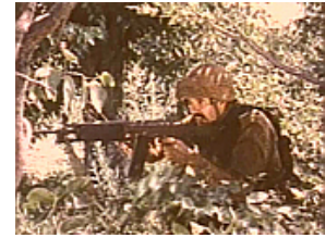
Member of the South African Infantry armed with the R-4 assault rifle