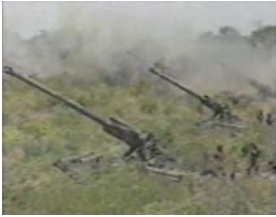
G-5's of the SADF in action in Angola, supporting ground forces